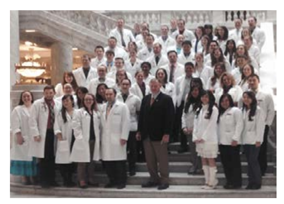
From UPhA's website: http://www.upha.com/?page=106

attendee helps reinforce the message. By attending Pharmacy Day on Capitol Hill, you can: express your opinion, demonstrate and explain the great services that pharmacy is providing, and learn more about the legislative process that impacts our profession."