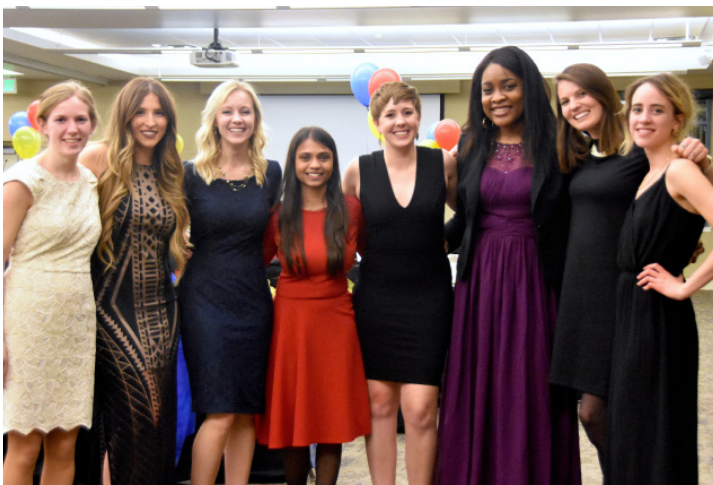
2018 Gala Committee